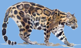
Fórmosa Clouded Leopard