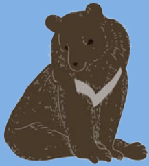
Fórmosa Black Bear