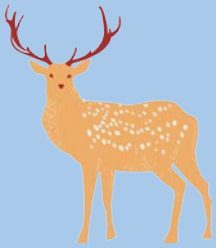
Fórmosa Sika Deer